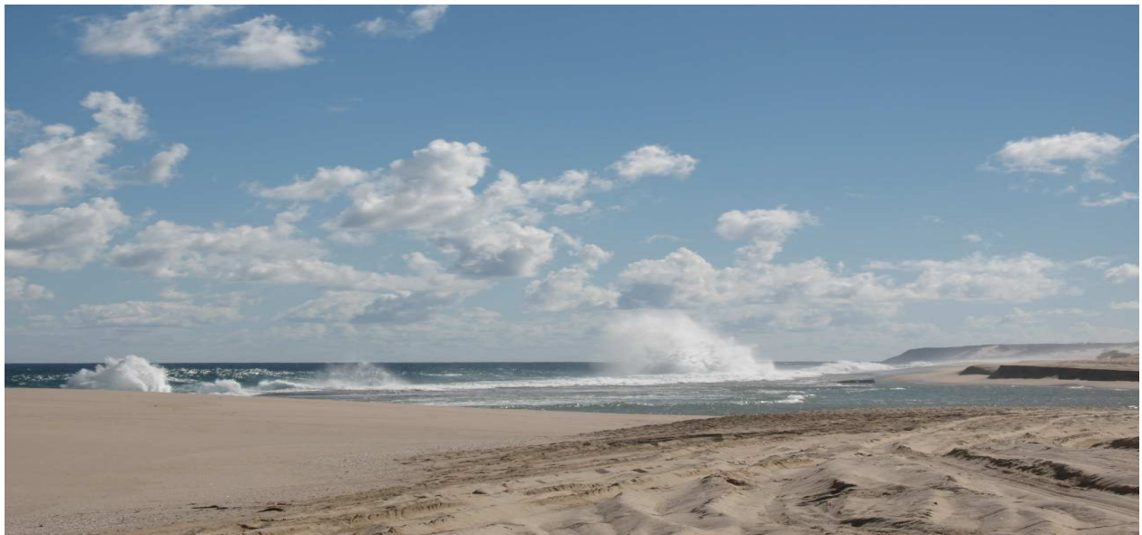
LOOKING NORTH ACROSS THE LAGOON TO THE KALBARRI CLIFFS

The bottom terrain is hungry on rigs so bring plenty of terminal tackle. If you are a competent caster then you can cast into sandy holes in some locations. Remember the wet suite and reef boots as the reef is vicious on exposed flesh.